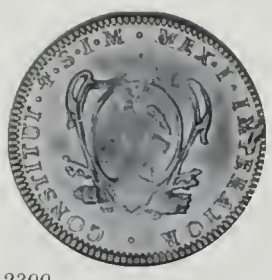
Lot No. 2399